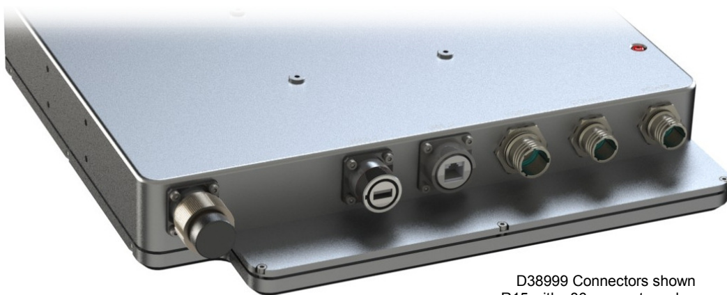
D38999 Connectors shown R15 with x86 connectors shown

USB3_0 or USB2_0: USB Type A (for Embedded Recorder, or an Embedded x86 option).